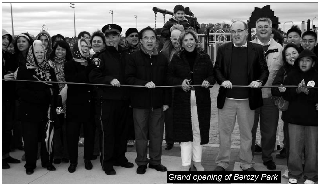
Grand opening of Berczy Park