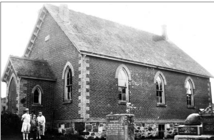
Hagerman Hill Methodist Church